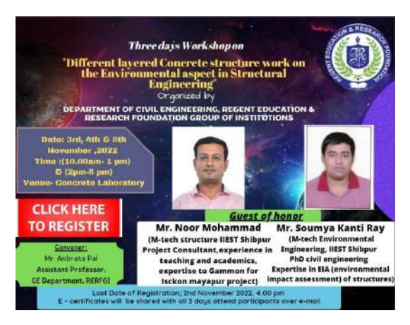
Flyer of the Event