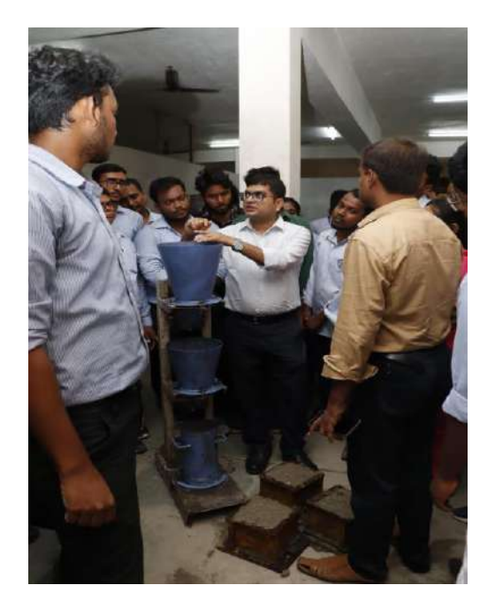
Slump Value Test