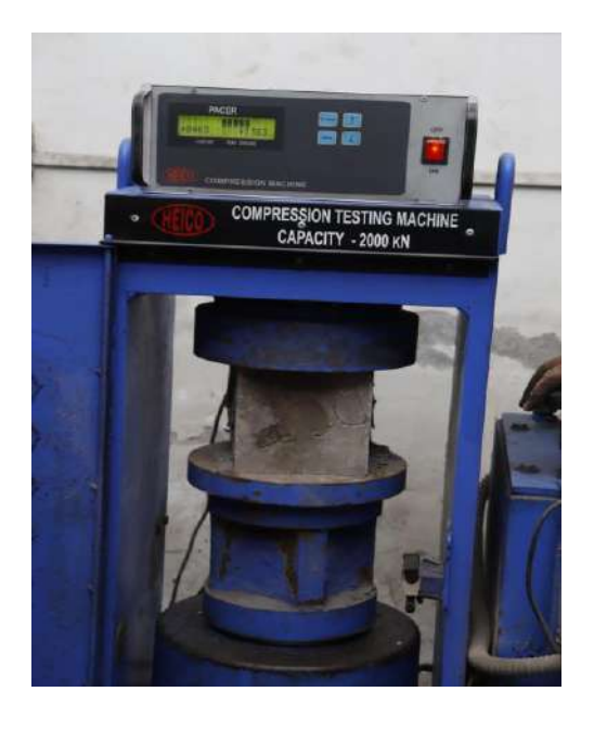
Compressive strength test