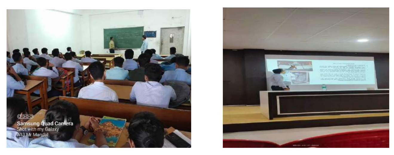
Lecture on Mix Design of concrete & Different type of concrete