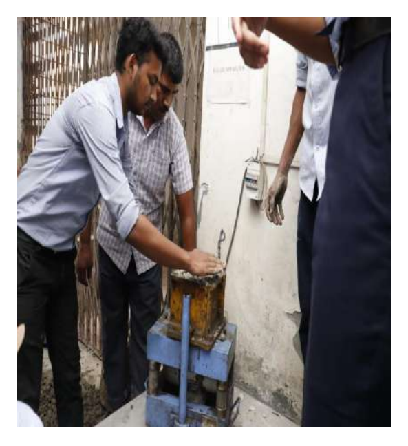
Concrete cube are extracted