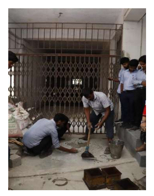
Concrete Mixing in lab